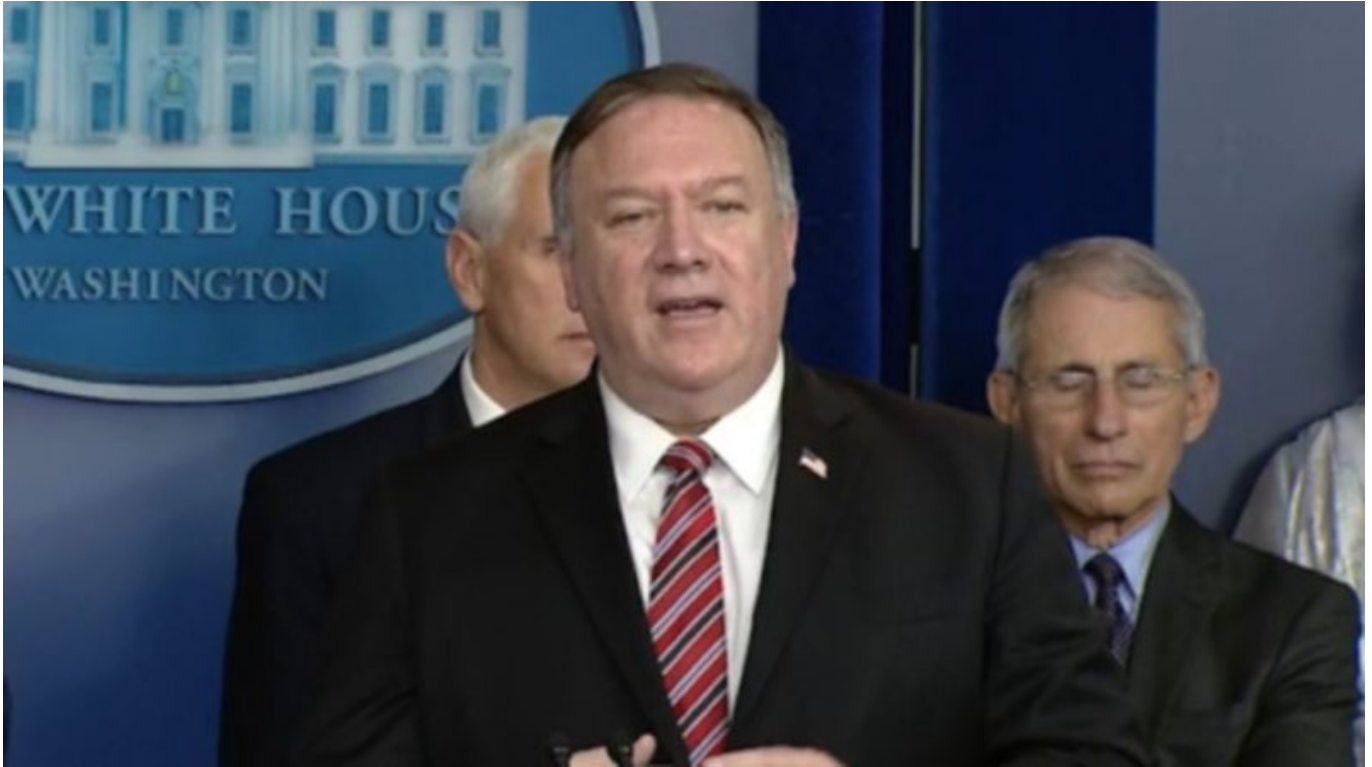
US Secretary of State Mike Pompeo