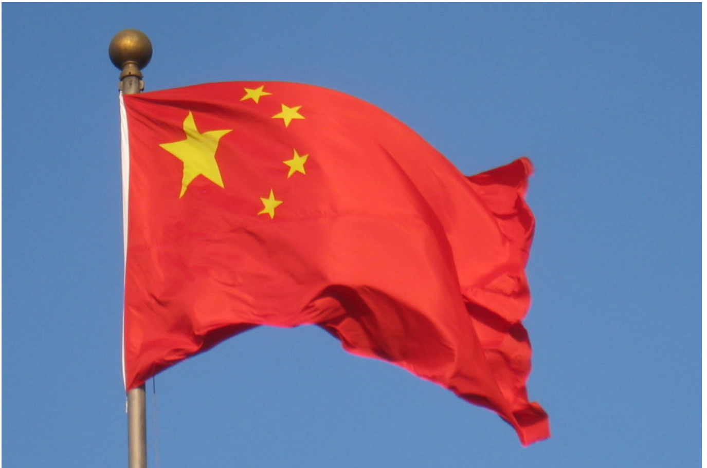
Chinese Flag/Image B&T

Second, garnering India's support to the democratic movement in Hong Kong, joining the western countries for joint efforts at isolating China in geopolitics. Indian support to the voices against human rights violations in Xinjiang at global fora. Third, we should to derecognize annexation of Tibet and be supporting the effort of the Tibetans to have self-rule and should give the Dalai Lama more recognition and position in diplomatic engagements, apart from visibility in India's political circles.