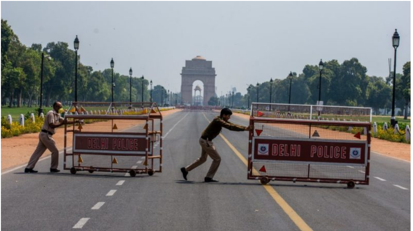
New Delhi, India.

India is in a complete lockdown of 21 days starting from 25 March. Death toll in India is increasing rapidly with cases of the infected persons crossing 700. Conditions are critical that Prime Minister himself has to come forward two times in a very short span. He has appealed the people to maintain social distancing. This is the toughest time when people are inside their houses and only those who are involved in essential services are working day and night to provide some relief for others. All the neighbouring countries are going through the same phase.