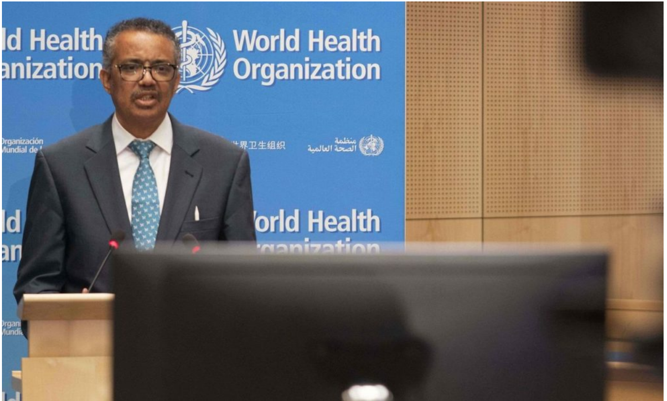
The WHO director-general, Tedros Adhanom addressing via video link to the World Health Assembly

Earth provides enough to satisfy everyone's needs, but not for a single man's greed