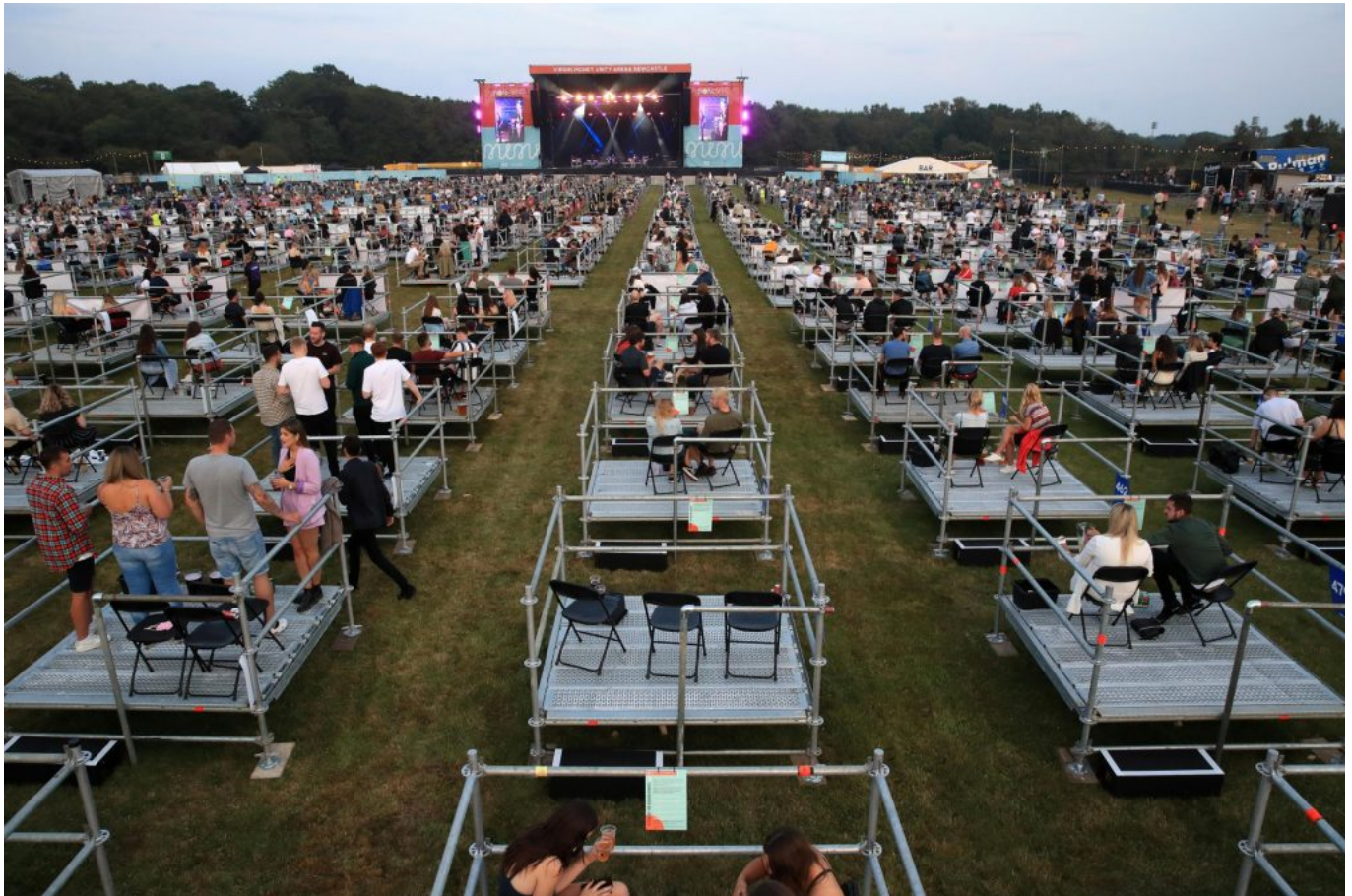
8/11/2020 - People during the Sam Fender concert at the Virgin Money Unity Arena, a pop-up venue in Gosforth Park, Newcastle. Fans in groups of up to five people are watching the show from 500 separate raised metal platforms at what the promoters say is the world's first socially-distanced gig.